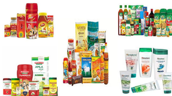
Fig. 1: Natural products of different brands Dabur, Zandu, Baidyanath, Himalayan and Patanjali

The natural products market in India is characterized by robust competition among several leading brands, each catering to different segments of the market. Dabur, one of the most established names, is renowned for its honey and Chyawanprash, products that are deeply embedded in Indian households (Kumar, 2016). Zandu, another