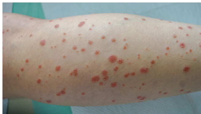
Figure 4: Effect of guttate psoriasis on skin

Tiny, sudden-appearing erythematous plaques are a symptom of a subtype of guttate psoriasis. Children or teens are commonly affected, and tonsillitis brought on by group A streptococcal bacteria is a common cause. A third of persons with guttate psoriasis will also develop plaque psoriasis during the course of their adult lives. 24 It is a kind of psoriasis that manifests as minute, scaly, red patches on the skin that resemble water droplets. It sometimes appears quickly, frequently following a streptococcal infection, and can affect sizable portions of the body, such as the scalp, arms, and legs (Figure 4) (Horreau et al. , 2013). Children and young people are more likely to develop guttate psoriasis, which may go away on its own or with treatment such as topical creams, light therapy, or oral drugs. In the future, those with guttate psoriasis may be more likely to acquire other types of psoriasis (Miller et al. , 2013; Pietrzak et al. , 2013).