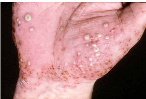
Figure 5: Effect of pustular psoriasis on the skin