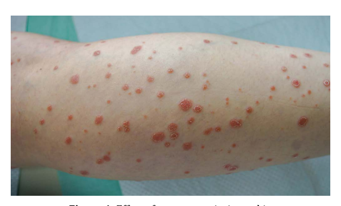
Figure 4: Effect of guttate psoriasis on skin

Tiny, sudden-appearing erythematous plaques are a symptom of a subtype of guttate psoriasis. Children or teens are commonly affected, and tonsillitis brought on by group A streptococcal bacteria is a common cause. A third of persons with guttate psoriasis will also develop plaque psoriasis during the course of their adult lives.<sup>24</sup> It is a kind of psoriasis that manifests as minute, scaly, red patches on the skin that resemble water droplets. It sometimes appears quickly, frequently following a streptococcal infection, and can affect sizable portions of the body, such as the scalp, arms, and legs (Figure 4) (Horreau et al., 2013). Children and young people are more likely to develop guttate psoriasis, which may go away on its own or with treatment such as topical creams, light therapy, or oral drugs. In the future, those with guttate psoriasis may be more likely to acquire other types of psoriasis (Miller et al., 2013; Pietrzak et al., 2013).