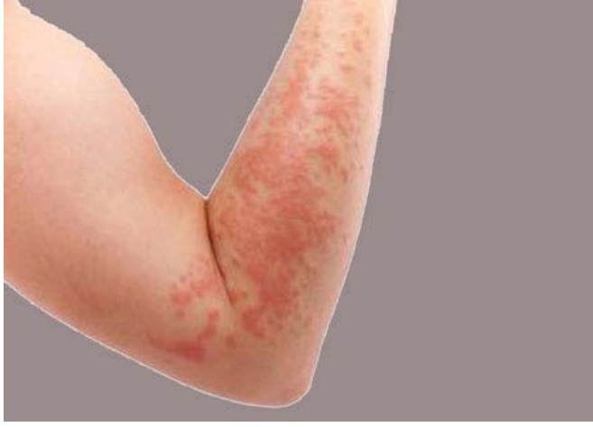
Figure 3: Inverse Psoriasis effect on the skin

on by a mix of genetics, immune system disorders, and environmental factors, while the precise origin is unknown. Topical creams, light therapy, oral drugs, and biologic pharmaceuticals are all available as psoriasis treatments. Although there is no known cure for psoriasis, many people can successfully manage their symptoms with the right care (Stern, 2010; Stern and Huibregtse, 2011).