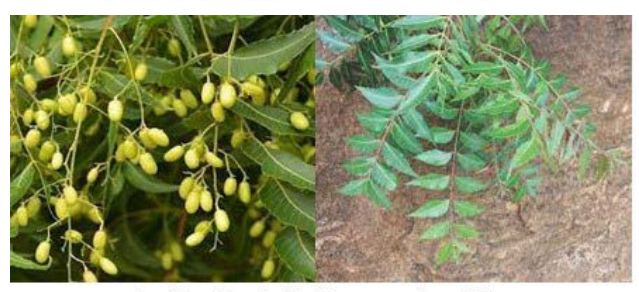
Azadirachta indica (leaves and seeds)