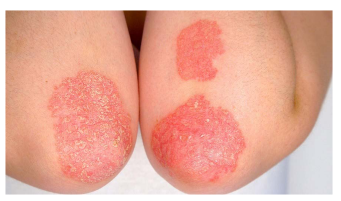
Figure 2: Skin covering plaques caused due to Psoriasis Vulgaris (Prodanovich et al. , 2009)

skin-covering plaques have the potential to develop and cover skin areas. The scalp, limb extensor surfaces, and the trunk are common locations (Figure 2) (Gelfand et al. , 2009). Around 2 to 3% of people worldwide suffer from plaque psoriasis, also known as psoriasis vulgaris, a chronic autoimmune skin condition. It can appear anywhere on the body, but the scalp, knees, elbows, and lower back are where it is most frequently found. These areas also tend to develop red, scaly, and occasionally itchy skin patches (Kimball et al. , 2010). Psoriasis is assumed to be brought