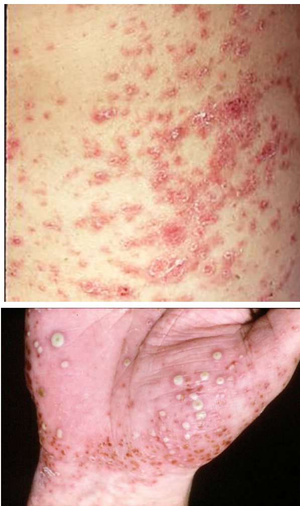
Figure 5: Effect of pustular psoriasis on the skin