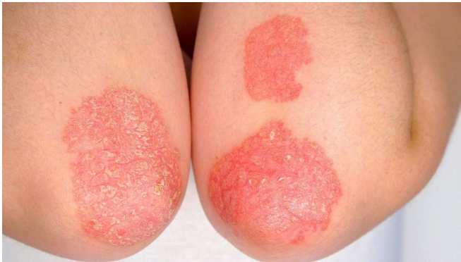
Figure 2: Skin covering plaques caused due to Psoriasis Vulgaris (Prodanovich et al. , 2009)

Tiny, sudden-appearing erythematous plaques are a symptom of a subtype of guttate psoriasis. Children or teens are commonly affected, and tonsillitis brought on by group A streptococcal bacteria is a common cause. A third of persons with guttate psoriasis will also develop plaque psoriasis during the course of their adult lives. 24 It is a kind of psoriasis that manifests as minute, scaly, red patches on the skin that resemble water droplets. It sometimes appears quickly, frequently following a streptococcal infection, and can affect sizable portions of the body, such as the scalp, arms, and legs (Figure 4) (Horreau et al. , 2013). Children and young people are more likely to develop guttate psoriasis, which may go away on its own or with treatment such as topical creams, light therapy, or oral drugs. In the future, those with guttate psoriasis may be more likely to acquire other types of psoriasis (Miller et al. , 2013; Pietrzak et al. , 2013).