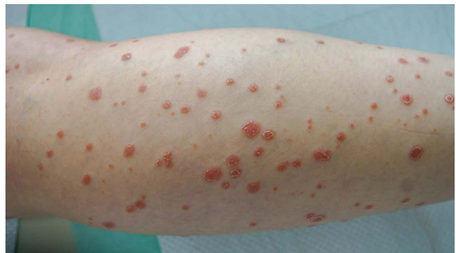
Figure 4: Effect of guttate psoriasis on skin