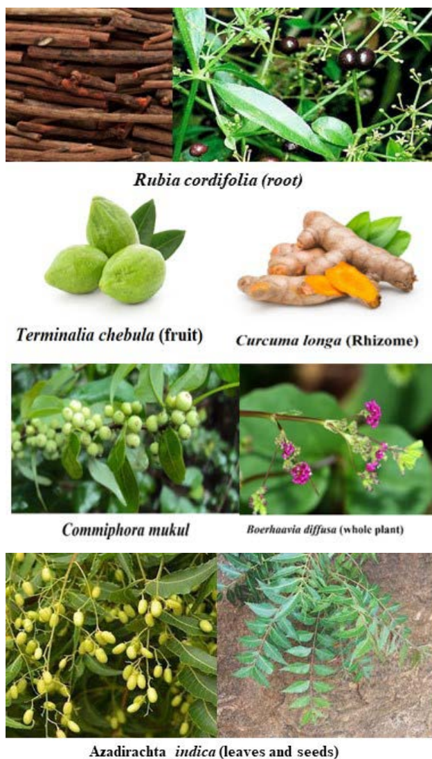
Figure 7: Different plants & their parts used in treatment

Biologics are a class of drugs used to treat psoriasis by targeting specific parts of the immune system involved in the disease process. For moderate to severe instances of psoriasis that are resistant to other therapies, these drugs are frequently utilized (Smith et al. , 2020). Tumor necrosis factor (TNF) inhibitors, interleukin (IL)-17 inhibitors, and IL-23 inhibitors are examples of biologics that can be given intravenously or intramuscularly (Mahil et al. , 2020). Adalimumab and etanercept are examples of drugs that suppress TNF, whereas ixekizumab and secukinumab are examples of drugs that inhibit IL-17. Drugs like guselkumab and risankizumab are examples of IL-23 inhibitors (Rajagopalan and Mital, 2016). Biologics are effective in improving skin symptoms and quality of life for many people with psoriasis but can be expensive and may have side effects, including increased risk of infection. During treatment, close supervision by a healthcare professional is essential (Dand et al. , 2019).