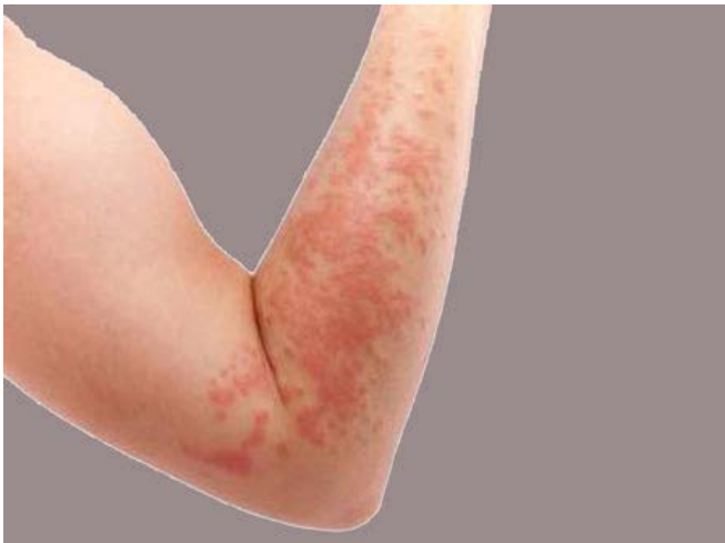
Figure 3: Inverse Psoriasis effect on the skin